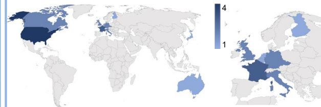
Geographical distribution of RDMM-Europe Seeding Grant recipients

We connect Solve-RD clinicians that have discovered new disease-causing genes with model organism investigators (MOIs) that can study the mechanistic role of the given genes in health and disease by using an appropriate model organism or cell culture system. To date, we have awarded 23 Seeding Grants to MOIs and have linked Solve-RD scientists to model researchers in eight European countries, Canada, USA, Qatar and Australia. Linking scientists across borders via the RDMM network and supporting these joint projects will advance RD research and will benefit patients and families living with RD.